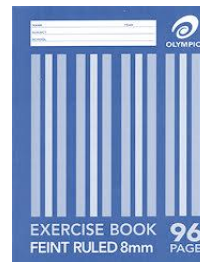
Exercise Book ~ Sample only ~