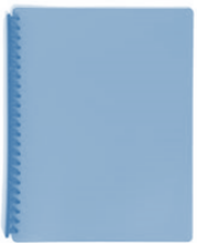
A4 Display Books

Pencil case for all classes, containing: